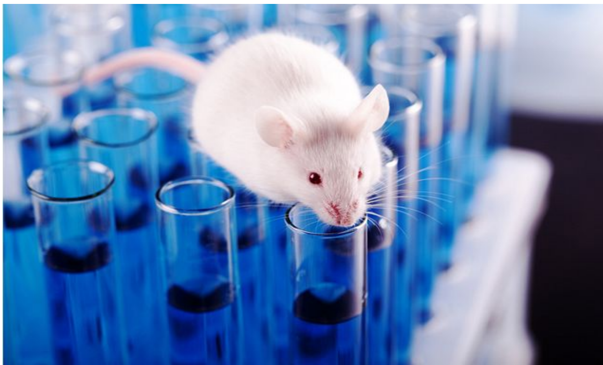
Figure: 1 chemical carcinogens

The last portion summarizes the overall research study and presents recommendations about topics. Chemical carcinogens are a class of compounds that need our utmost attention and caution in the complex web of the chemical world. These shadowy beings have the sneaky capacity to upset the delicate balance of our biological systems, opening the door for unchecked cell division and the terrifying possibility of cancer. Within public health and Science, it is vital to comprehend the properties of these carcinogens and create efficient techniques for evaluating their possible risks.